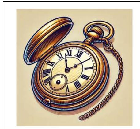
Alexander played with his dad's pocket watch.

Then make a prediction! What do you think happened next? Circle one picture and describe why you chose it.