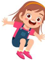
j u mp