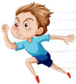
f a st