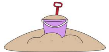
s a nd