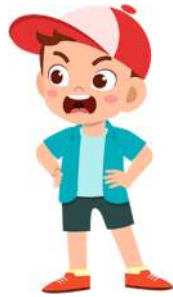
m a d