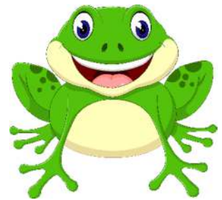
f r og