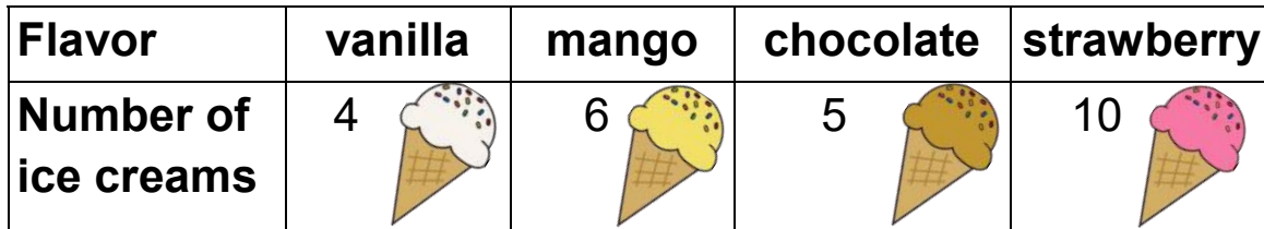
Ice cream flavors

Create a bar graph and answer the questions.