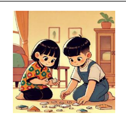
Max and Ava apologized to their mom and helped clean up the mess.

Max and his sister, Ava, were playing Tag inside. They knew it was against the rules, but they loved to play! They had lots of fun until Max knocked over his mom's favorite vase. It fell to the ground with a loud crash and broke into lots of little pieces!