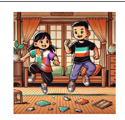
Max and Ava kept playing Tag around the mess.