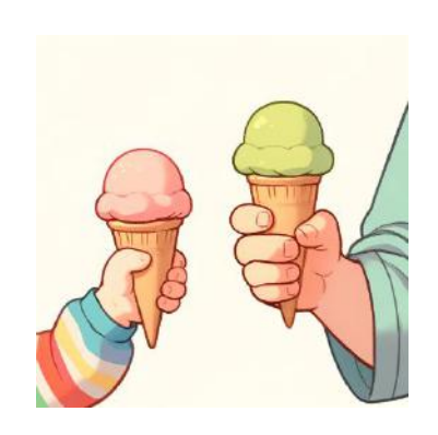
Max and Ava decided to have some ice cream.

3. Read or listen to the short story. Then make a prediction about what happens next, and tell the rest of the story.