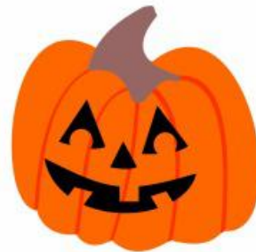
Jack O' Lantern