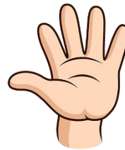
h a n d