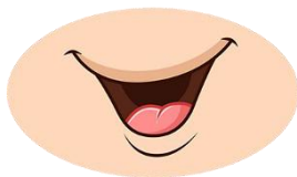
m o u th