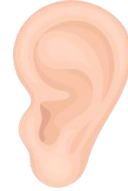
e a r