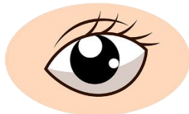
e y e