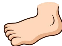
f o o t