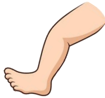
l e g