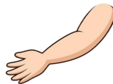
a r m